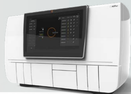
Fig 1. Description of the automated ASTar process.

Proprietary algorithms translates visual information into MIC values. Based on EUCAST or CLSI breakpoints, MIC values are interpreted as S, I, or R.