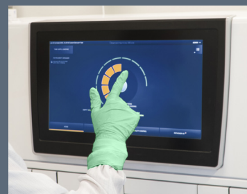
Fig 1. Description of the automated ASTar process.

Proprietary algorithms translate visual information into MIC values. Based on EUCAST or CLSI breakpoints, MIC values are interpreted as S, I, or R.